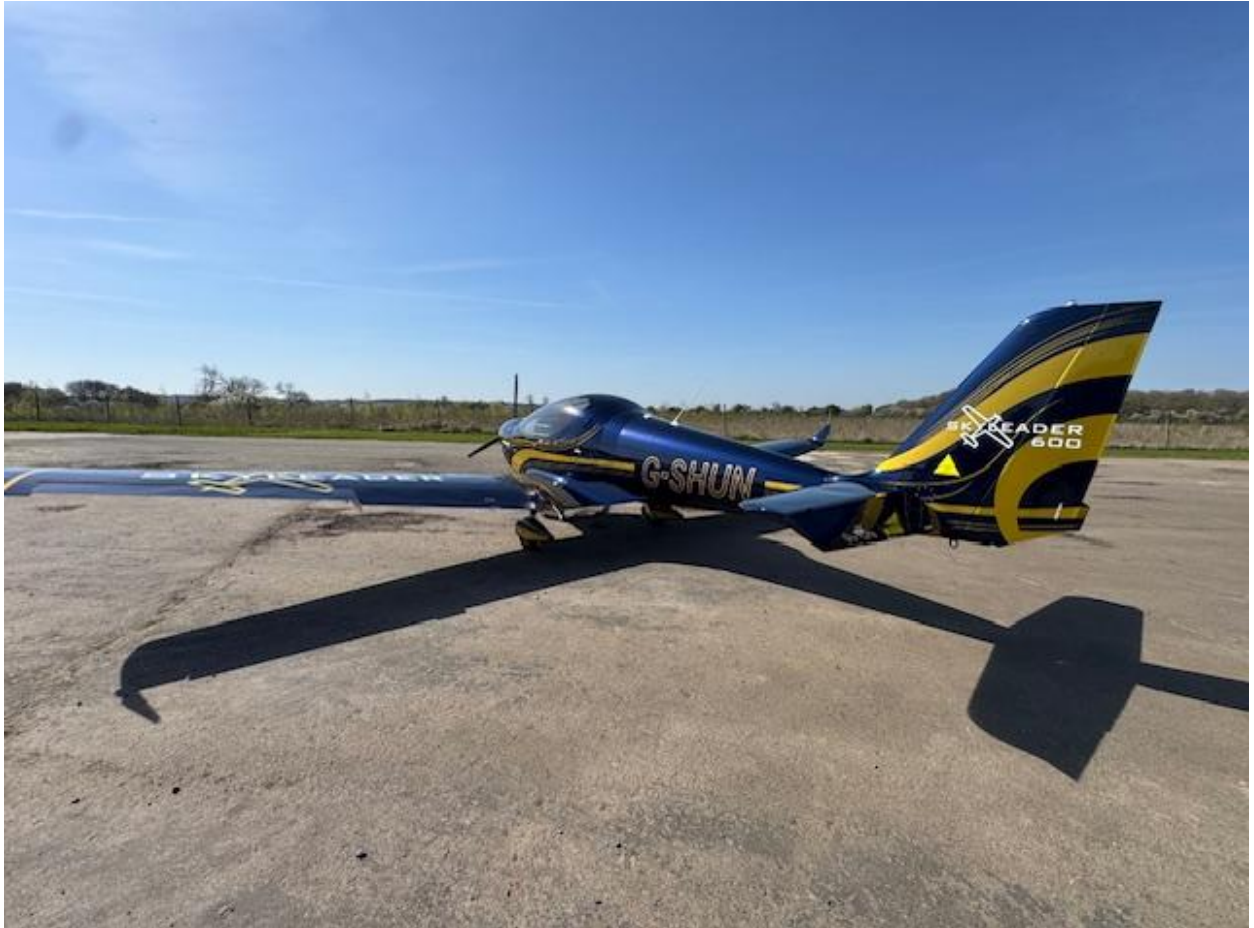
Illustration of Aircraft – Photograph

Issued on behalf of the UK CAA by the BMAA, UK CAA organisation approval ref. DAI/8909/84