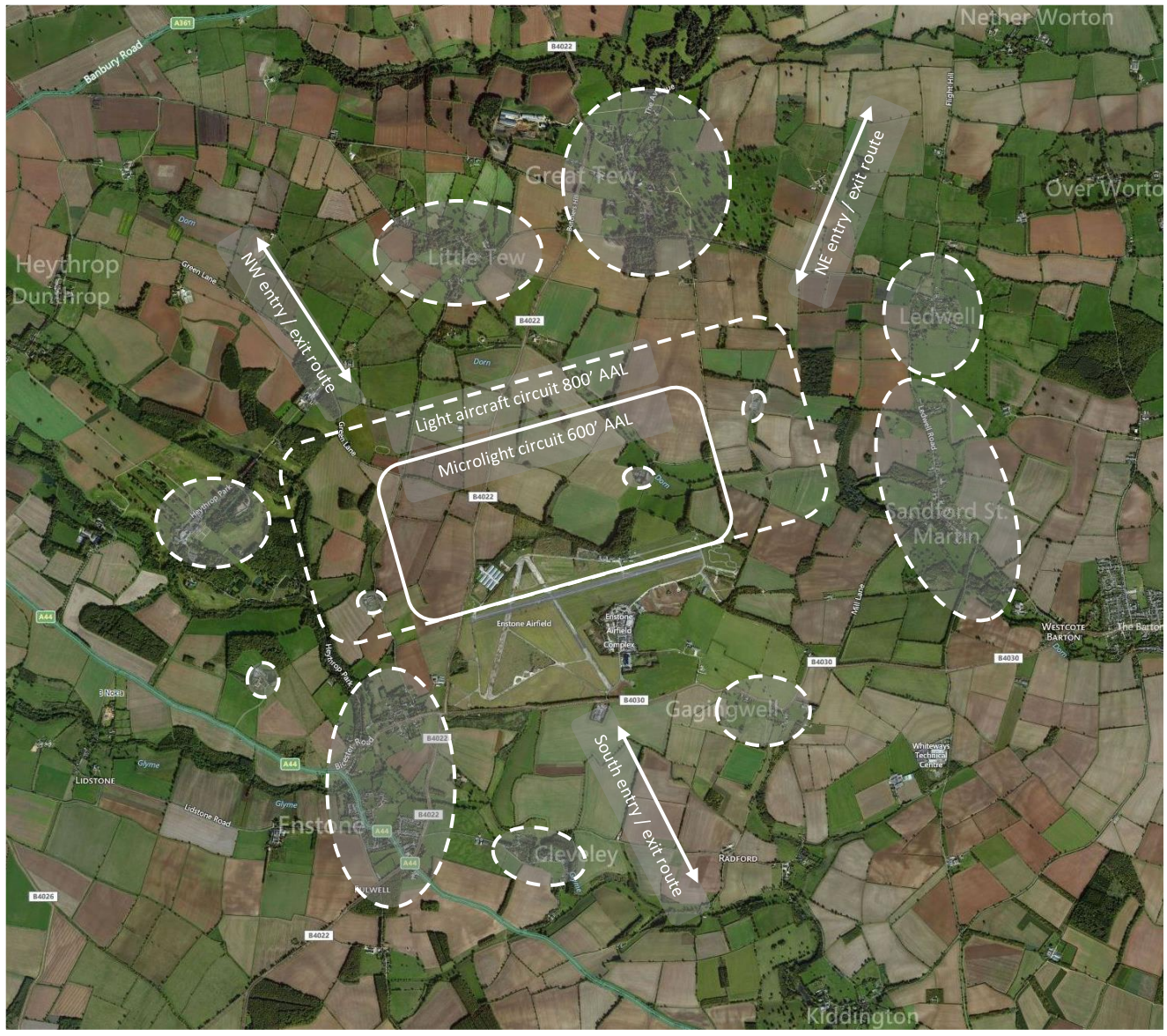
Figure 1: Enstone airfield circuit pattern(s), entry and exit routes, noise sensitive areas