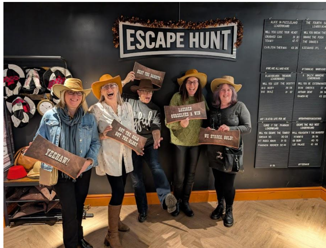
BMAA staff at our recent awards