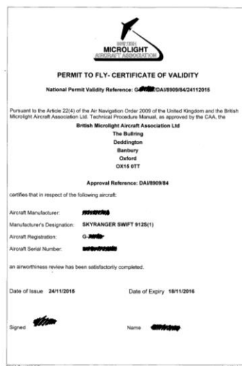
Figure 2: a Certificate of Validity for the Permit to Fly in figure 1.

The inspection includes a review of the aircraft's paperwork as well as an inspection of the airframe. One of the paperwork checks is to confirm that all required maintenance actions have been performed (see section 2.2).